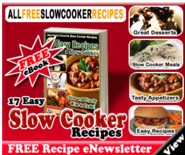
17 Easy Slow Cooker Recipes