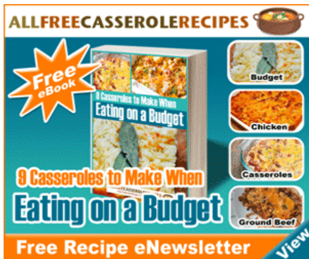
9 Casseroles to Make When Eating on a Budget