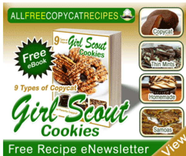
9 Types of Copycat Girl Scout Cookies